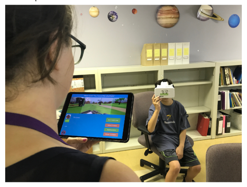
Figure 1. The monitor uses an iPad to supervise the Floreo session with a learner.

Prior to the first VR session, all participants underwent a joint attention assessment to capture their existing status of joint attention behavior. This assessment was a novel measure developed by the study team to directly assess joint attention skills in school-aged children (details of the assessment are available from the authors upon request).